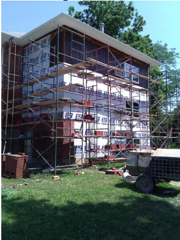
Brickwork Back Addition 2011

UPDATE: At our trustee meeting we had the first good look at the improvements. We have begun two projects the renovation to the back of the house opening up three more usable rooms for the guys. The windows are being replaced for $4,114. We are removing the old siding and replacing it with brick to match the addition for $19,881. Some of you may have watched it being built, back in the day.