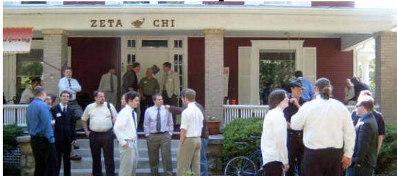
Taken Stag 2006