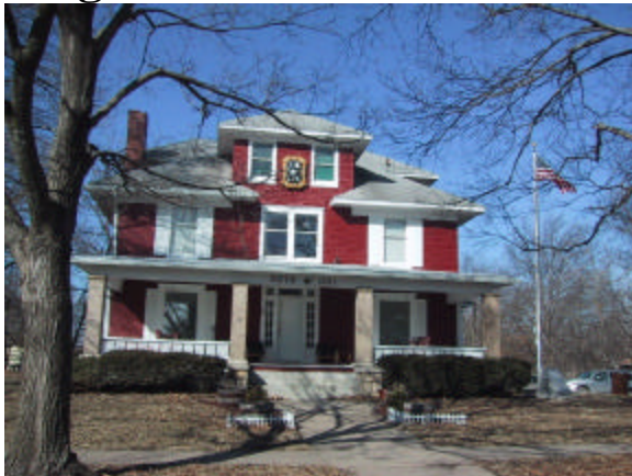
Taken February 2008