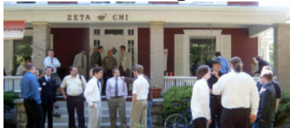
Taken Stag 2006

ZX Building Fund was started during the 100-year celebration and continues to have an impact. Significant gifts for the improvements of the house have given our actives a higher standard of living and attracted new members. Some of the improvements were: