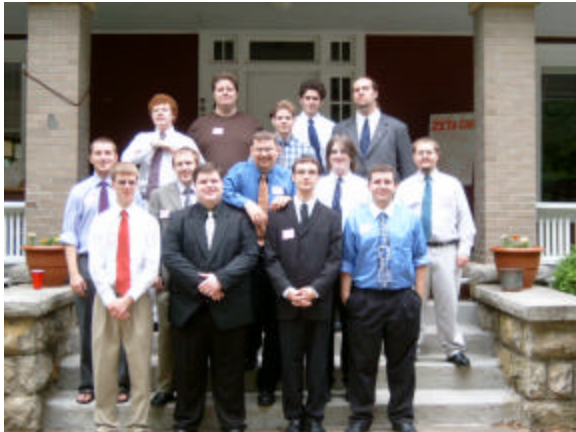
The men of Zeta Chi looking their best!